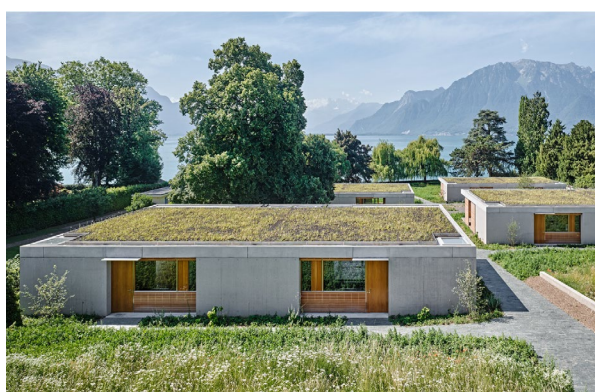
La Becque Residences, La Tour de Peilz.