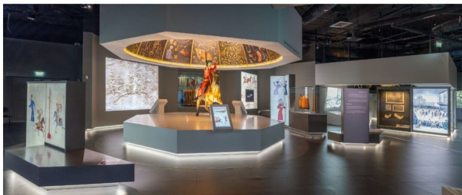
Qatar-Olympic and Sports Museum , Gallery 2, Asia Zone