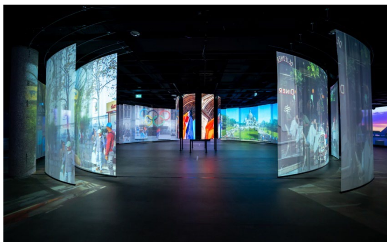
Paris 2024 temporary exhibition