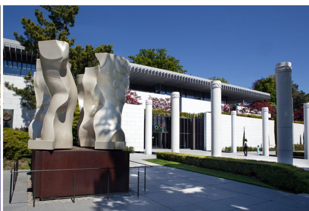
Olympic Museum, Lausanne.

Participating Artists (“ Applicants ”) shall express their preference in completing the Residency either with the 3-2-1 Museum or with the Olympic Museum. Applicants will be considered for both locations. The final allocation of residencies will depend on the Jury’s decision, but preferences will be taken into account where possible.